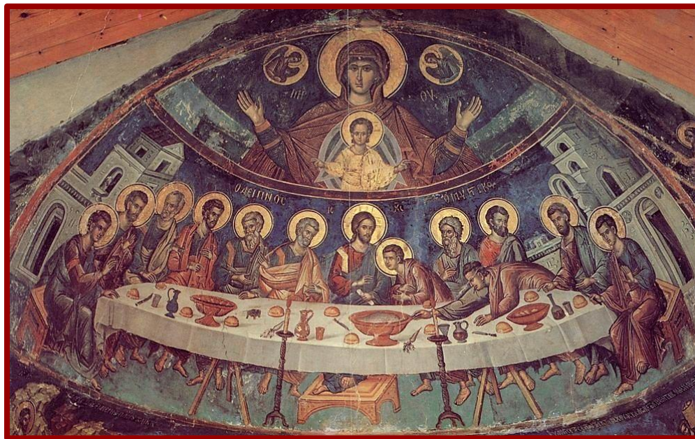
Mystical Supper by Theophanes the Cretan, 1546, Stavronikita Monastery, Mount Athos

While hospitalized this Holy Week, 2001, on Holy and Great Thursday he penned the following in his notes.